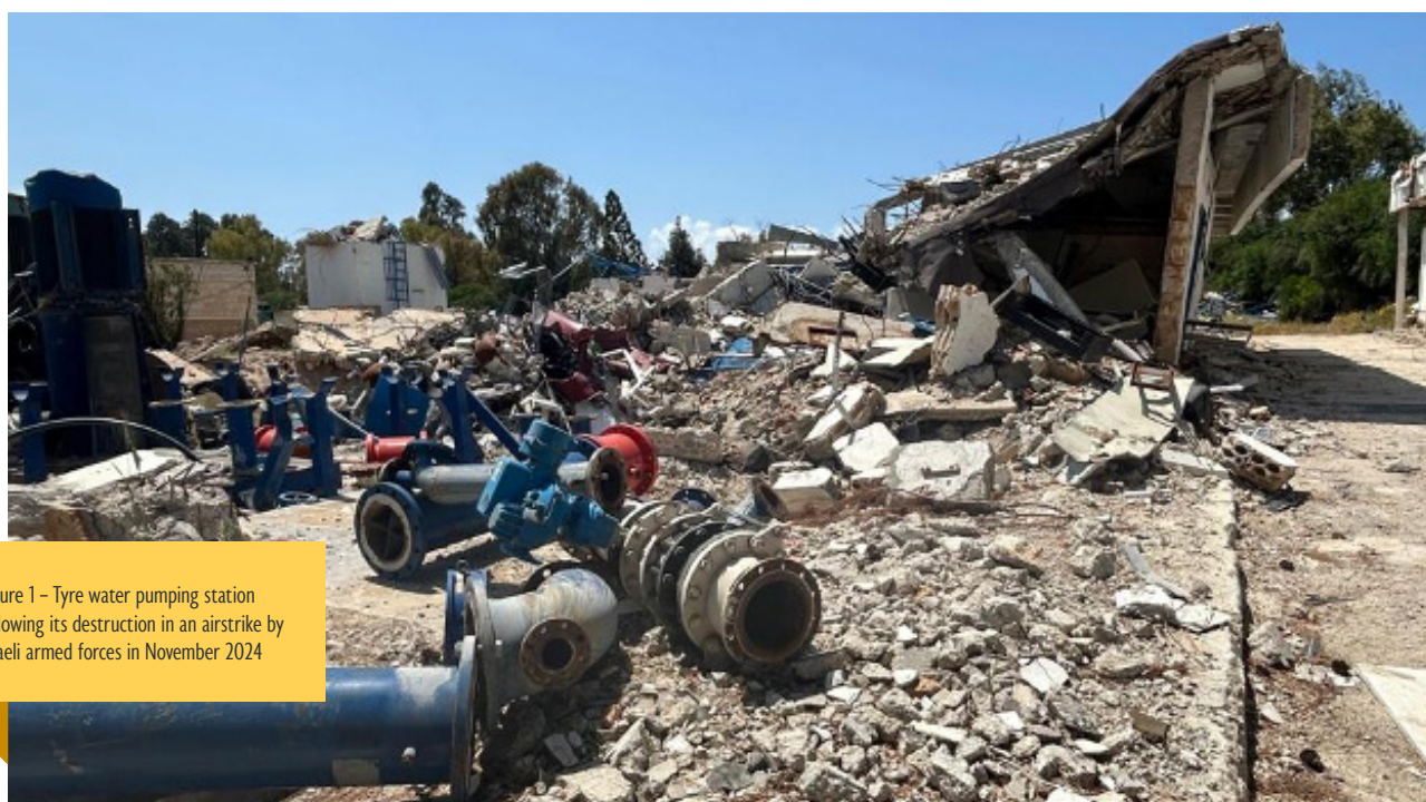
Figure 1 – Tyre water pumping station following its destruction in an airstrike by Israeli armed forces in November 2024

Fourth, the damage and destruction add significant financial burdens to the Lebanese state, already under pressure since the 2019 socio-economic crisis. This is not only due to the need for repairing damaged and destroyed infrastructure but also due to the loss of revenue by water authorities following the interruption of water services and the creation of "non-revenue water." This denotes water that is lost or unaccounted for before it reaches the end consumer, and that consumers can therefore not be charged for. 6 Overall, the conflict in Lebanon is estimated to have created losses of US$171 million across the water, wastewater and irrigation sectors. 7